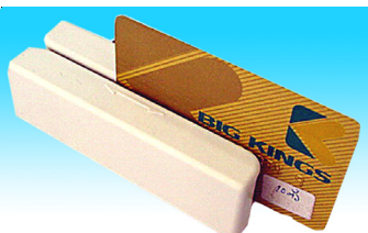
# MCR - B02TTL (C-YA-A-00022)